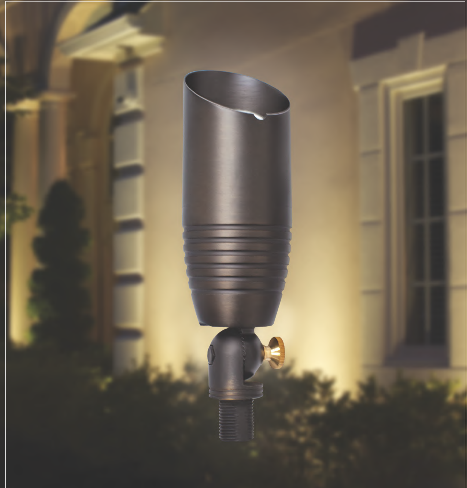
SL01 UP LIGHT